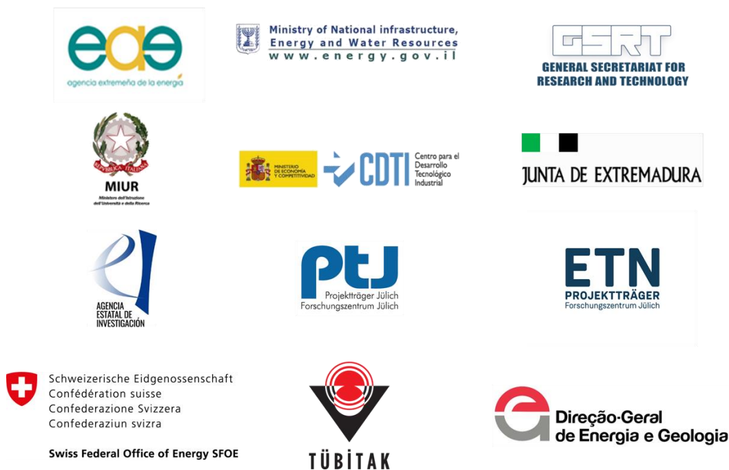
Figure 2: Organisations involved in promoting the CSP ERANET 1st Cofund Joint Call and providing support and funding to innovative transnational projects.

The participating national CSP-ERANET partners / contact points are listed in Table 1. Each applicant is strongly encouraged to check the project idea with the national contact point as early as possible in the preproposal phase, at the latest before submitting any applications.